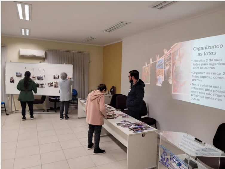
Images from the Photovoice workshops in Pelotas.